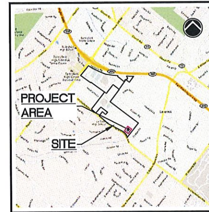
SITE LOCATION MAP 1" = 2,000'

SPRINGFIELD TOWNSHIP, MONTGOMERY COUNTY, PENNSYLVANIA