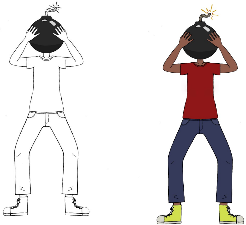
By Mara W.

Solitary by Eilis A. Solitary sits on the dock Quiet on her left, Peace the right Waves giggle 'round the trio laughing merrily at the sky Clouds dance in the ceiling combing, dividing, allying, defecting Seagulls spy for fish calling for reinforcements Light arcs over the merry sparkling multicolored rays Boats cut through the waves white specks seeking the open evading bobs of buoys reveling in salty winds Triangle noses briefly emerge curious eyes scan waves and sky one second, two and three four then disappear to down below Solitary, Quiet, and Peace sit Serenity now in their midst Company approaches the four Joy, Laughter. Conversation too with Love and Life looking on the original three evolved to ten turned to nine quite instantly Solitary retreating away